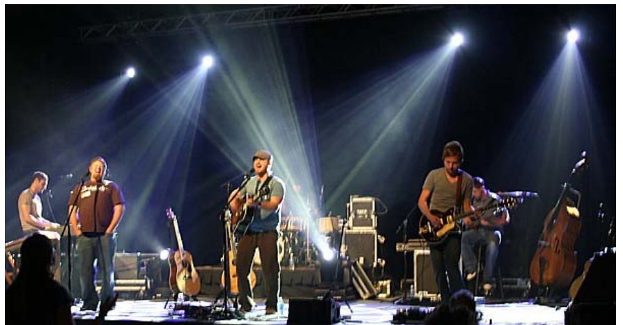
Shane & Shane and band play at Belmont University's Curb Event Center in Nashville Aug. 22.

“...[Shane & Shane] continue to deliver lyrical and musical mastery on their sixth album.” -- CBA Retailers+Resources (8/07)